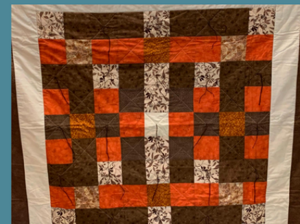
B.T. has esophagus cancer and has a feeding tube.