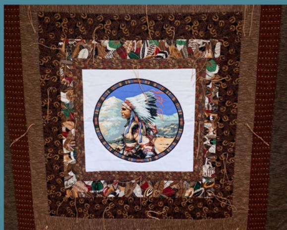
A.J. Family is suffering from COVID-19

Viewing for Weekend Services from October 17 - 18 total 2,507