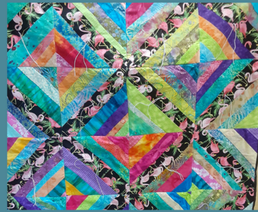
CR in need of strength and healing.

Viewing for Weekend Services from November 28 & 29 total 2,692