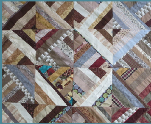
HG is a victim of a stroke.