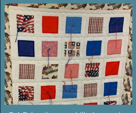
D.A.R. brother was killed on active duty in Japan.

Your prayers are requested for our virtual prayer quilts. If you have Facebook, please click on each quilt, pray, and then "like" the picture to symbolize the tying of a knot. Knots will be physically tied by staff as a tangible representation of all the prayers and love offered on behalf of those in need. Even if you do not have Facebook, you can still pray for those receiving the quilts.