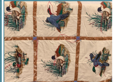
T.G. battling bladder cancer.