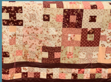
L.H healing from foot surgery.