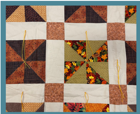
Jim is suffering from elevated blood pressure.