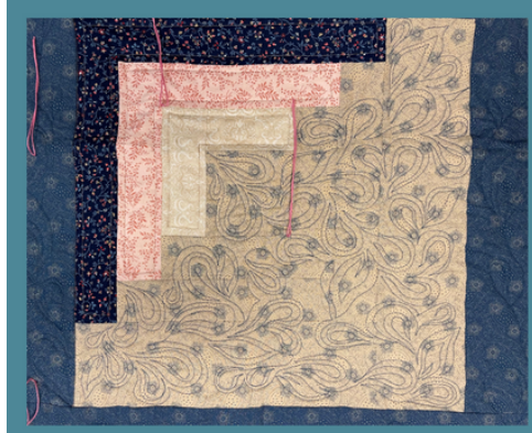
Lynn is recovering from surgery for an obstructed bowel.

Viewing for Weekend Services from May 29 & 30 total 2,492