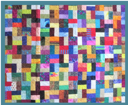
Michael is healing from physical ailments.

Viewing for Weekend Services from March 27 & 28 (Palm Sunday) total 2,650