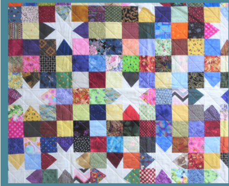
Trevor is suffering from COVID-19.