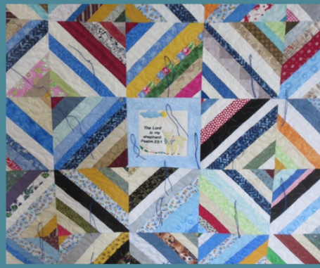
Sue's pancreatic cancer has returned.