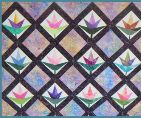
Ray is suffering from multiple health issues.