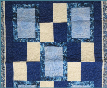
Doreen is recovering from a knee replacement.