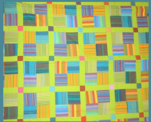
Jennifer in memory of dad who died from COVID-19.

Viewing for Weekend Services from February 27 & 28 total 2,324