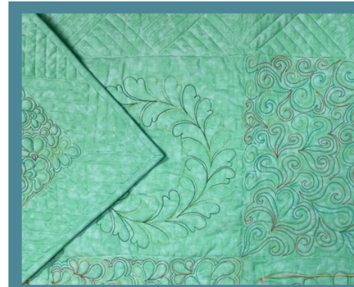
Heather is suffering from a debilitating muscle and bone disease.

Viewing for Weekend Services from May 15 & 16 total 2,262